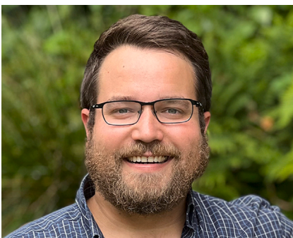
Charles L. Evavold Ragon Institute and Harvard Medical School, Cambridge, MA, USA

Ideally, one would like the ability to quantitatively assess cellular composition and function in the tumor microenvironment (TME) in real time. Parameters of interest include where a cell is located relative to the tumor and to other immune cells, what the cell is doing (degranulating, secreting cytokines, etc.), and how many copies of a particular clone are present in the TME and how its population size changes over time. A technology platform that combines intravital imaging with multiplex and repeatable assessment of protein and/or mRNA transcripts could dramatically enhance our ability to develop next-generation cell-based therapies.